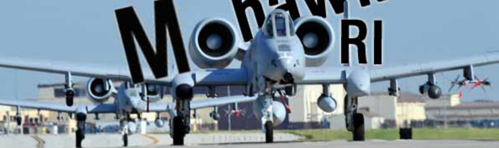
Training and Deploying Ready Reservists in September 2011