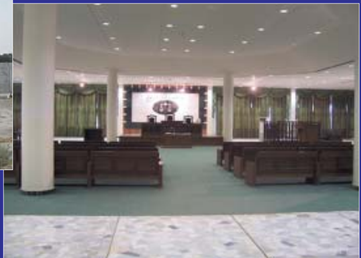
Right: The interior of the main Central Court of Iraq court room.