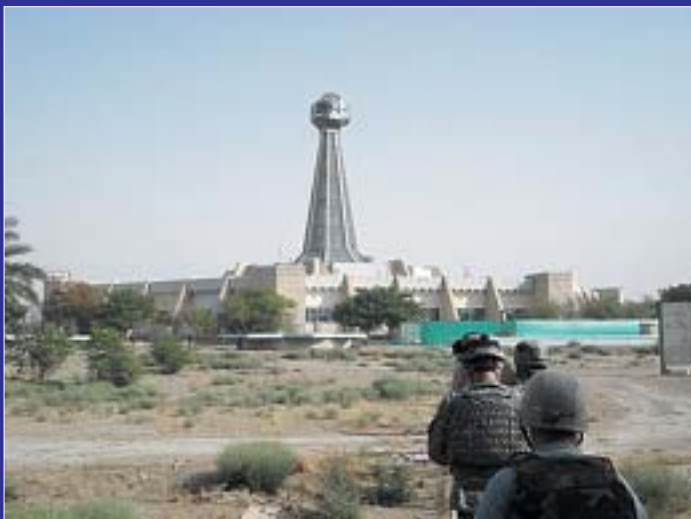
Above: The Central Criminal Court of Iraq is located in a former museum once dedicated to the glory of Sadaam Hussein.