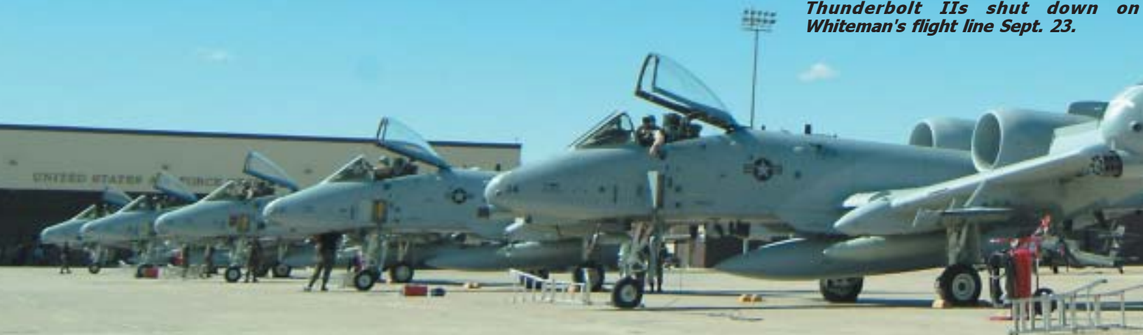
Background photo: Home from Afghanistan following a four-month deployment, 442nd Fighter Wing A-10 Thunderbolt IIs shut down on Whiteman's flight line Sept. 23.