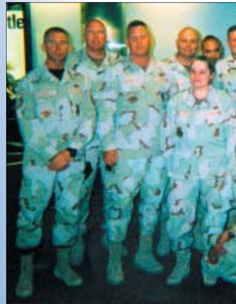
The thirteen-member 442nd Security Forces Squadron returned home just in time for Veterans Day after patrolling the streets in Baghdad's "green zone" for nearly two months.