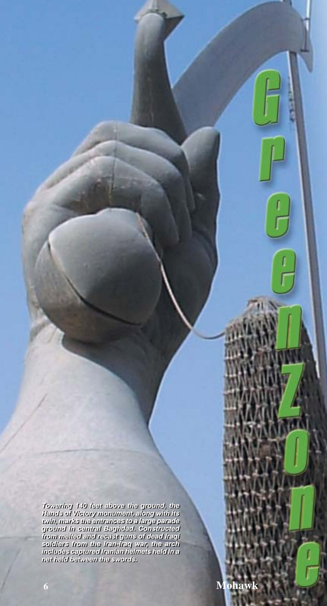
Towering 140 feet above the ground, the Hands of Victory monument, along with its twin, marks the entrances to a large parade ground in central Baghdad. Constructed from melted and recast guns of dead Iraqi soldiers from the Iran-Iraq war, the arch includes captured Iranian helmets held in a net held between the swords.