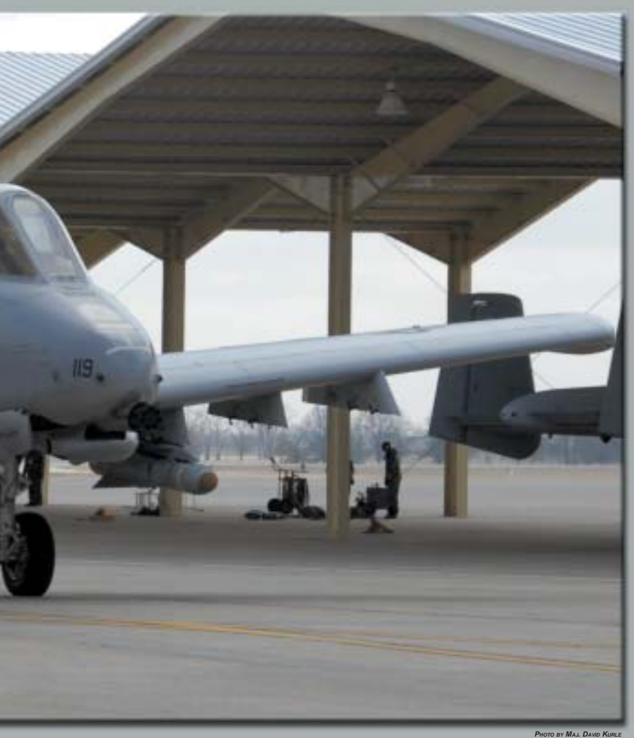
An A-10 taxiing to its parking space Jan. 13 is one of 26 upgraded with new electronics by the 442nd Maintenance Group.