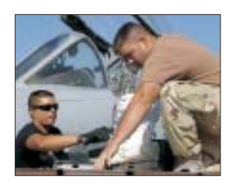
AFGHAN ACTION Wing deployment near halfway point PAGES 6 & 7

303rd Airman earns ALS Levitow award PAGES 5